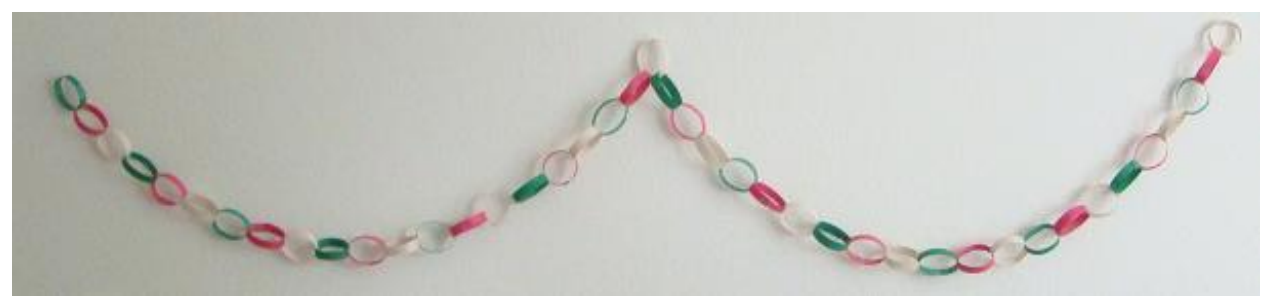
Use these paper chains to decorate for a 5 de mayo celebration!