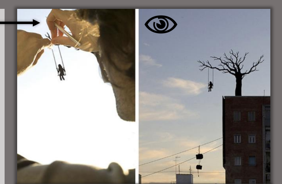
Artwork by Artist Pejac: #stayarthomepejac